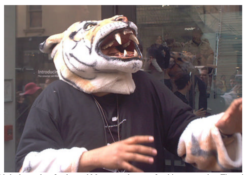
Little did she know that, for devoted Mac users, there are few bigger stars than Tiger right now.

Meanwhile, some passersby outside the SoHo store looked on in bewilderment at the ever-growing line of Tiger-buyers and cheering Apple store employees (complete with a dancing man in a Tiger suit). One woman who walked by shrugged and said, "Maybe there's a celebrity."